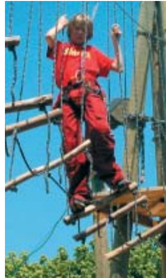
Top: The "tractor" of Beit Hillel.

Jeep tours in the Upper Galilee, the Golan, Mt. Hermon, the Hula Valley, and the Lower Galilee. From one-hour rides to trips of a few days. The jeeps have seven seats and the drivers are local residents. Option of night excursions. (04) 686-8666 .