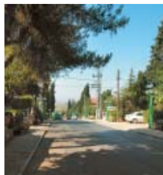
Above: The main street of Metulla.