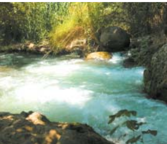
Water rushing through Nahal Hermon.