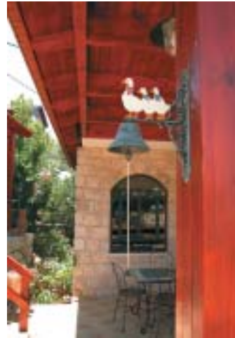
Top: Beside a Nahal Dan stream at Kibbutz Dafna. Above: Nofesh Baharim, Ramot Naftali.