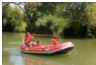
Top: The Maayan Baruch Junction bridge over Nahal Snir. Above: Boating on Nahal Snir.

And let's not forget the mountains of Upper Galilee, which tower above the Hula Valley and are graced with shady forests, fantastic views, and most of all, the marvelous landscapes of Israel's green north.