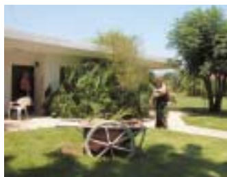
Top and above: Guest room and pool at She'ar Yashuv

Tel Hai Youth Hostel (04) 694-0043. Mt. Hermon Field School, Snir (04) 694-1091.